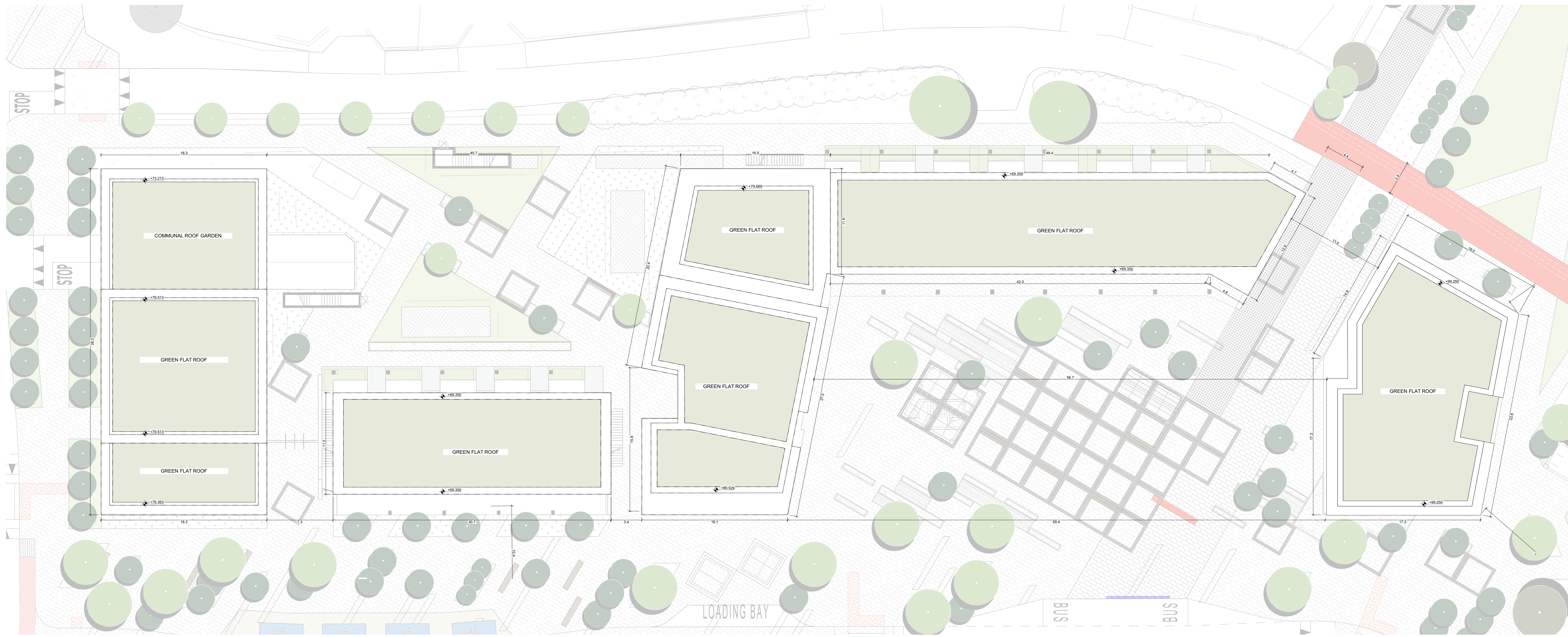
ROOF PLAN SCALE 1:200